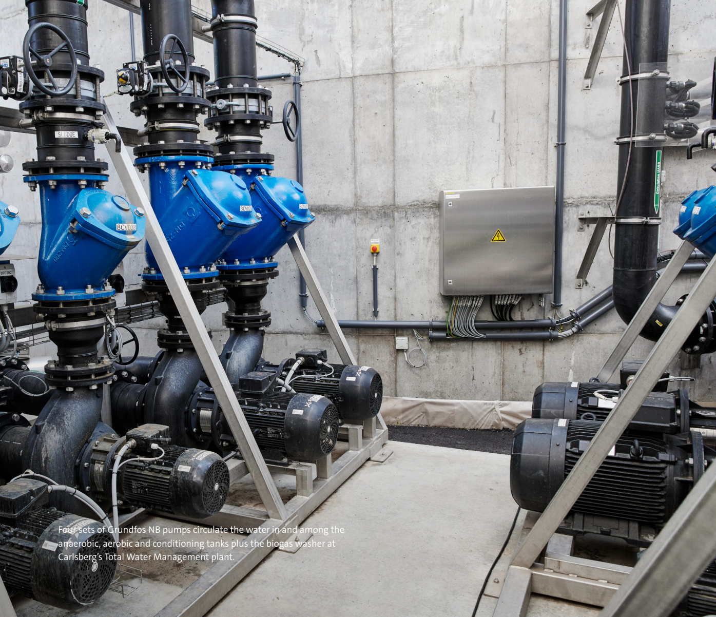
Four sets of Grundfos NB pumps circulate the water in and among the anaerobic, aerobic and conditioning tanks plus the biogas washer at Carlsberg's Total Water Management plant.

Sources. Information in this article came from interviews with all sources on-site at Carlsberg in September and October 2021, onsite at NIRAS in October 2021 and via online video chat with Pantarein in October 2021. More information about the DRIP partnership and studies on water reuse can be found at this website .