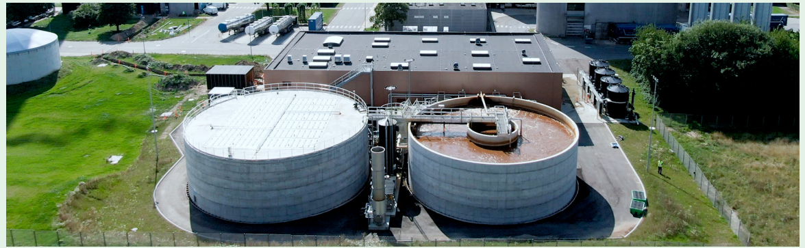
Carlsberg’s Total Water Management plant in Fredericia, Denmark uses anaerobic and aerobic wastewater treatment. The anaerobic tank on the left produces biogas, which Carlsberg uses to produce heat for the brewing processes, adding another layer of sustainability to the project.