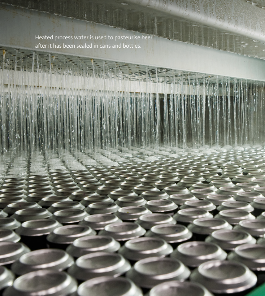
Heated process water is used to pasteurise beer after it has been sealed in cans and bottles.

“Think of what we can now do. We can actually recycle and close the circuit, making process water available again. It’s fantastic.”